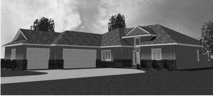
804 South Country Lane (Country Club Estates subdivision) Built by Ralph Gulig Construction, Inc.; designed by Travis Baus, Pro-Build

Win a $289,000 house, $145,000 cash prize or many other valuable prizes!